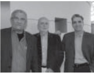
Poetry and Politics: Derek Walcott, Adam Zagajewski, Robert Pinsky

us" rhetoric of the Bush administration.