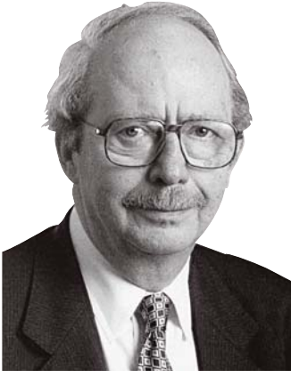
Lord Dahrendorf, member of the British House of Lords, professor of sociology and former director of the London School of Economics, has been a close friend and supporter of the IWM for many years.