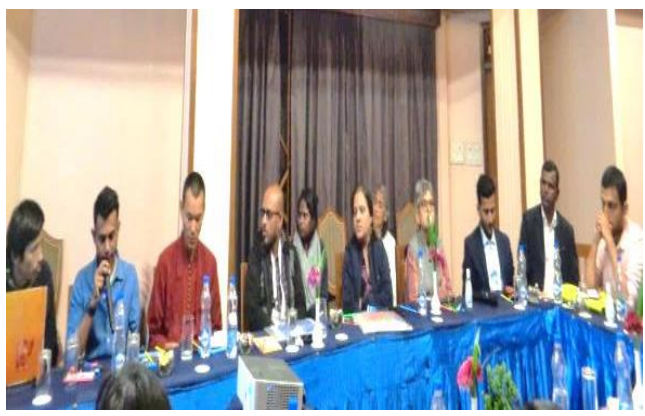
Sessions in the Youth Meet