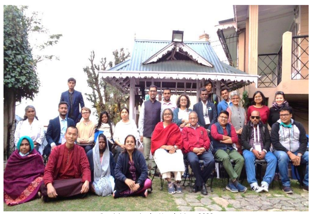
Participants in the Youth Meet 2022