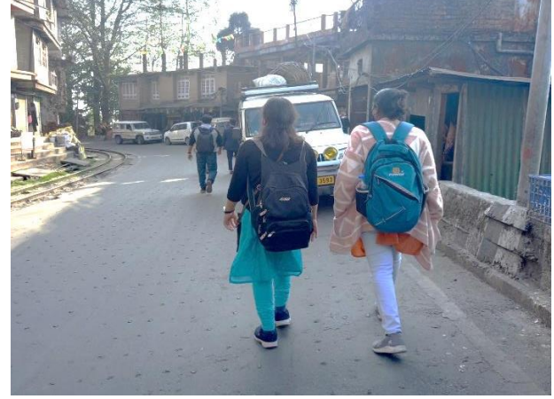
Glimpses from Field Visit