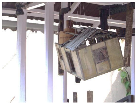
Installation of art by Ankan Datta