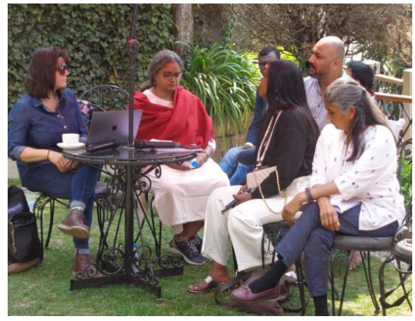
Sharing of work experiences in solidarity