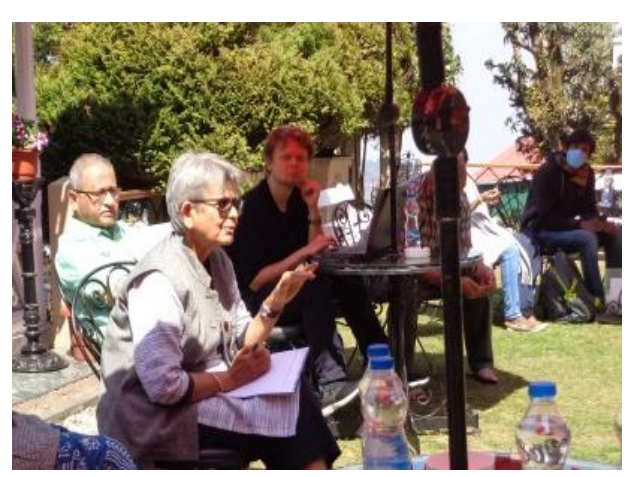
Reflection on the way forward