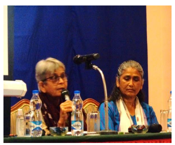
Session on Gender and Migration